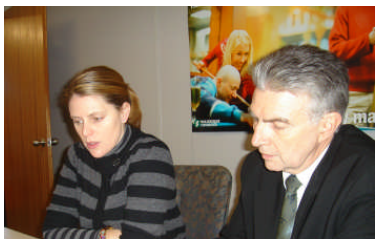
Chloë with Minister Hill

Dozens of senior residents attended a health forum run by the Hon. John Hill MP, the Minister for Health at the Holdfast Bay Community Centre on August 6.