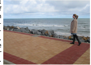
Walking the coastal path